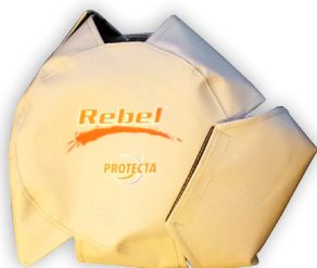
REF : 3590010

Small cover for 6 m and 10 m Rebel™ SRL's