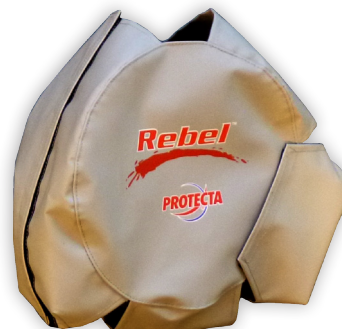
REF : 3590012

Large cover for 20 m, 25 m and 30 m Rebel™ SRL's