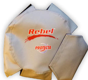
REF : 3590011

Small cover for 6 m and 10 m Rebel™ SRL's