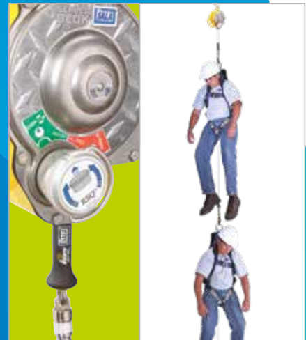
Automatic Descent Mode Self Rescue Descent