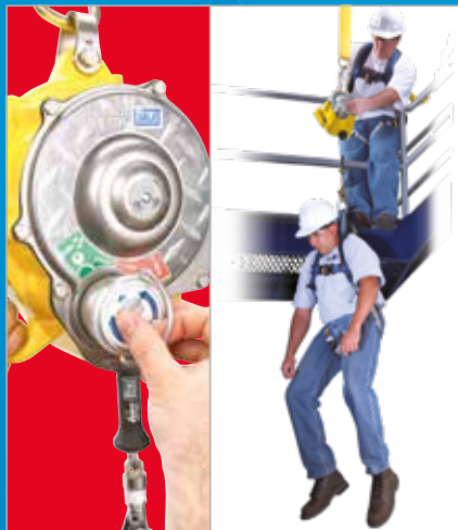
Fall Arrest Mode Assisted Rescue by Hand