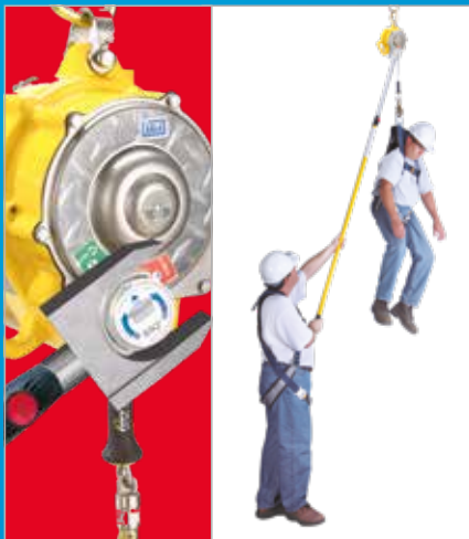
Fall Arrest Mode Assisted Rescue by Hand

Traditional assisted rescue operations may also be conducted.